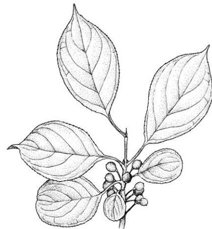
common buckthorn in fruit

Flowers - Small, greenish-white flowers with 5 petals appear in May or early June.